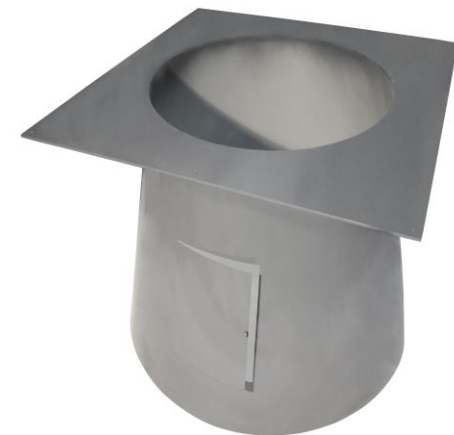
Custom Cone Base 36/48 With 50" Square Top Plate With 36" Round Hole With 12" Square Access Door.

Fantasy Creations in Metal Inc. Ph-951.280.0438 Fax~951.280.0458 Metalsdiva@FCMetals.com. www.FCMetals.com